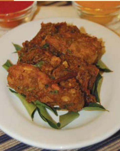
88. CHETTIAR FRIED CHICKEN (DRY)