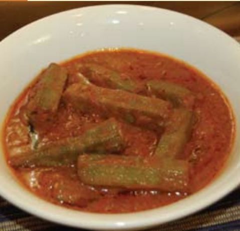
98. BINDI PULI KOLAMBU