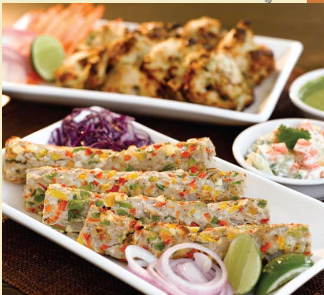
BACKGROUND: 15. MURG GAJAB KA TIKKA