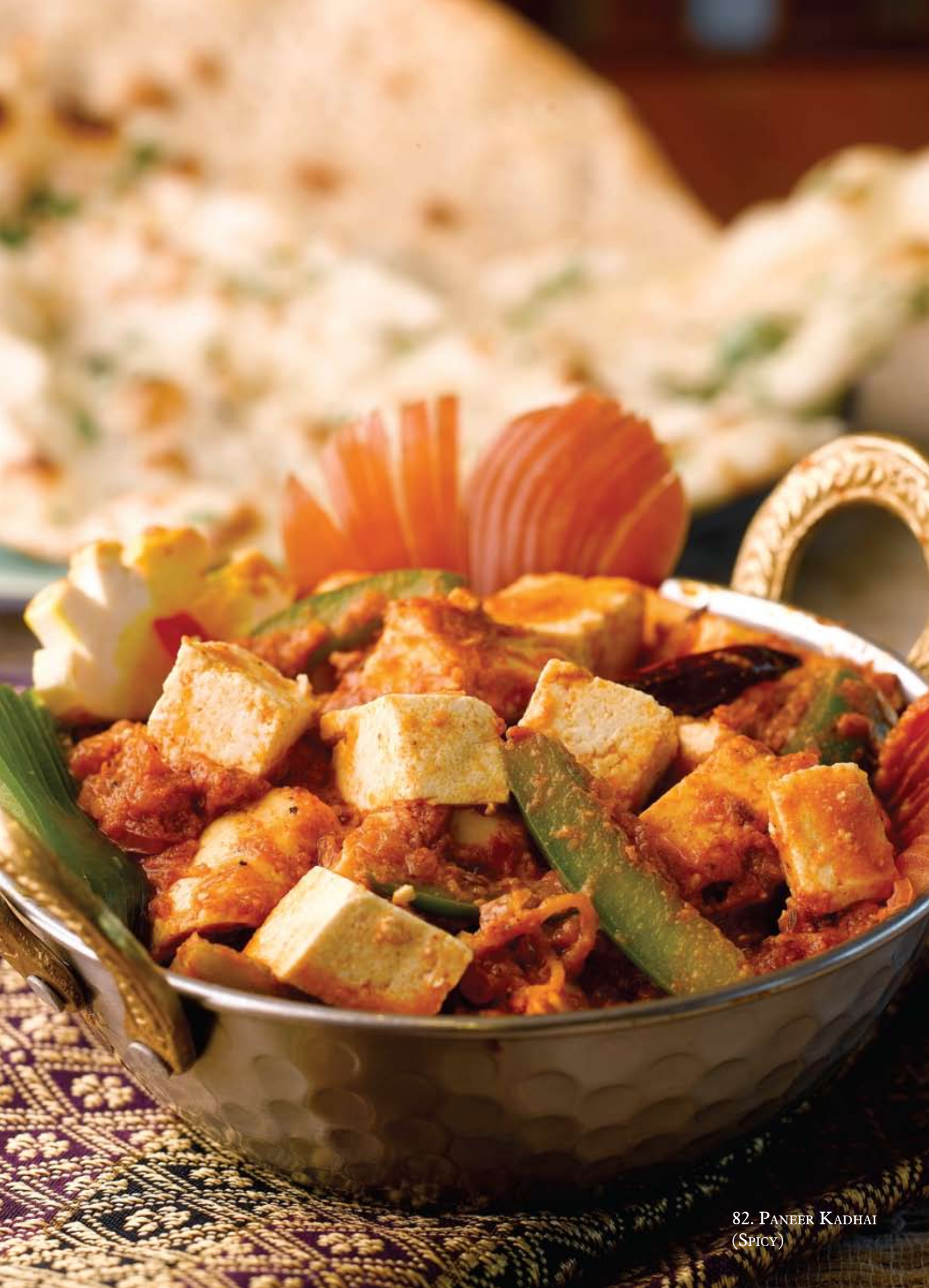
82. PANEER KADHAI (SPICY)