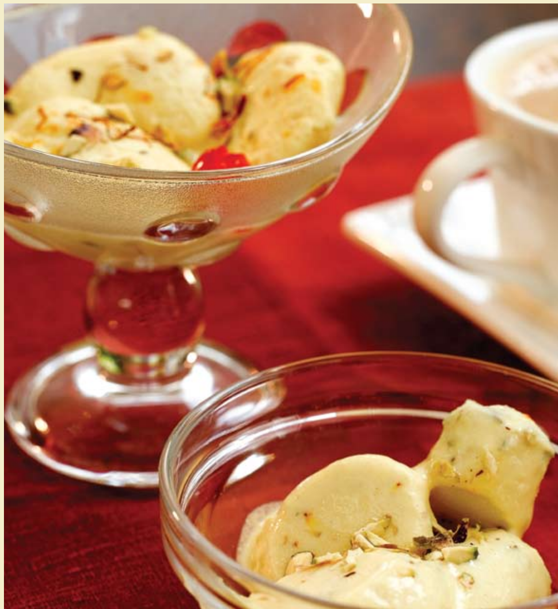
TOP: 228. BENGALI RASMALAI