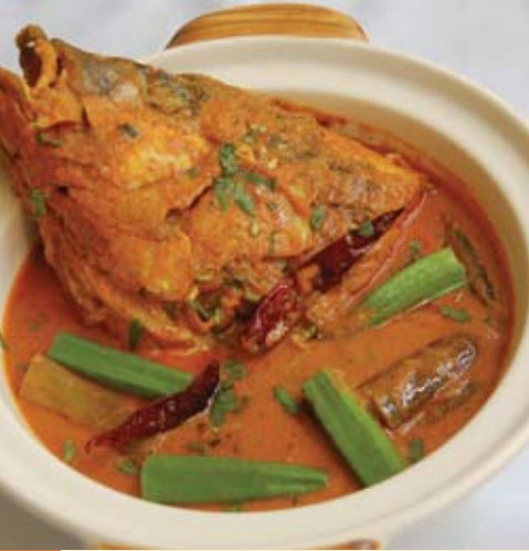
91. FISH HEAD CURRY (SOUTH INDIAN STYLE)